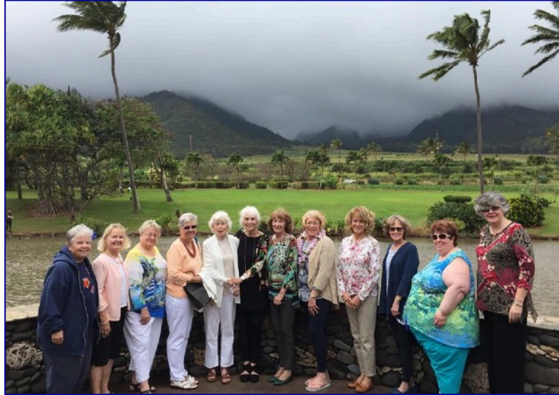
Lunch Bunch attendees at the Mill House on March 13th.

WE HAVE SUCH A BUNCH OF LUNCHES COMING UP!