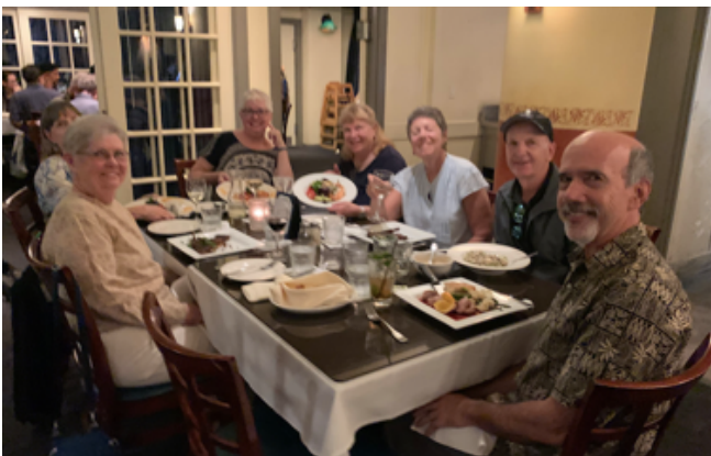
Tastes and Talk at Bistro Casanova, Kabului