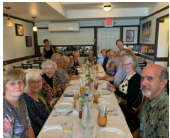
Lunch Bunch at Nutcharee's Authentic Thai Food