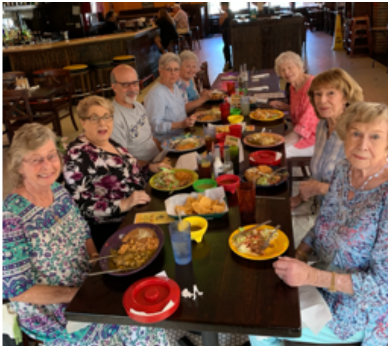
March Lunch Bunch at Fernando's Mexican Grill