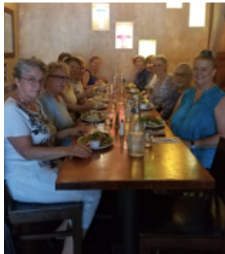
Last Month's Lunch Bunch at Pita Paradise

REMINDER .....The Maui Branch still needs a new Lunch Bunch coordinator. If you are someone who likes to explore the Maui restaurant scene, this is the opportunity for you! Lunch Bunch is held on the second Tuesday of the month. But, you wouldn't have to attend every month if that is an issue. Please send a note to aaumlunchbunch@gmail.com if you are interested in taking this on or would like more information. Mahalo!