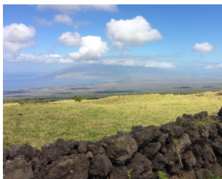
Images of our beautiful Maui.