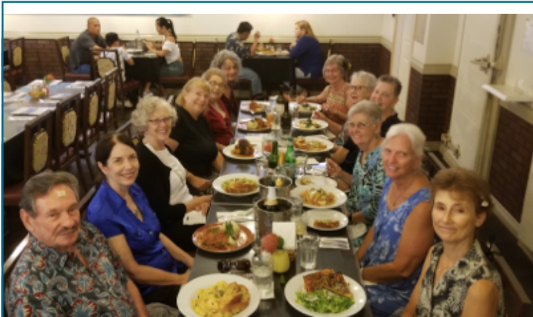
Maui Branch members and friends enjoy Tastes and Talk at the Kula Bistro