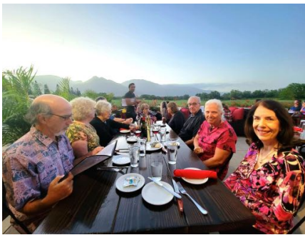
Taste and Talk at Fuego's Steakhouse at Maui Lani Golf Course