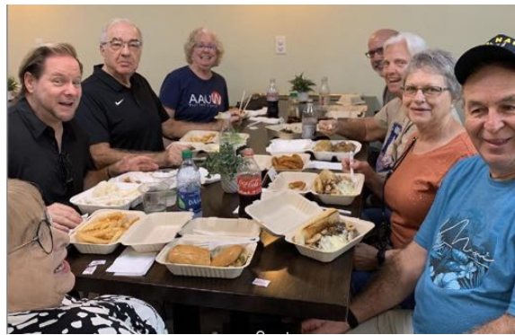
Lunch Bunch at Kalei's Lunchbox in Kahului